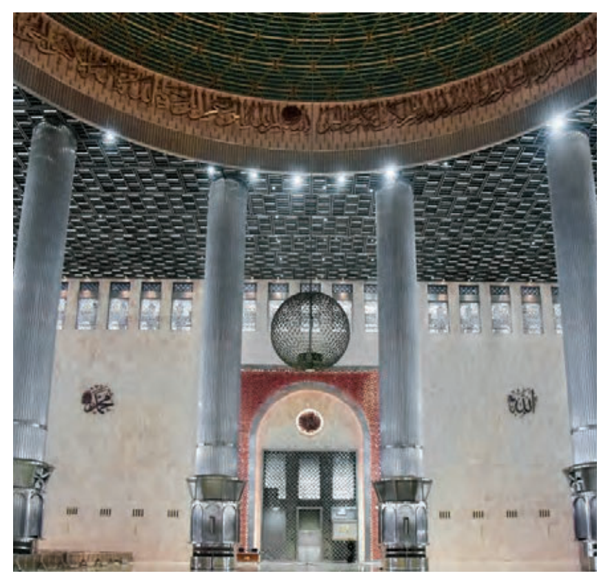
Worshippers focus on the main wall or qibla