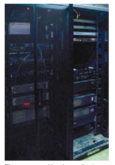
The rear second-level room hosts multichannel amplifiers, audio distributors and a DP-SP3 processor

on the size of the zones and the number of loudspeaker outputs, five of the panel frames host between one and four DA-250F amplifiers, while a spare 150W amplifier has been added to the main control panel frame for network redundancy.