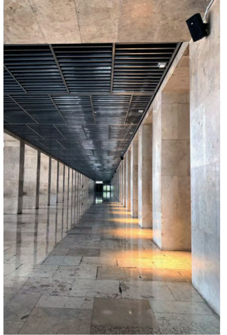
TOA ZS-F2000 and ZS-760B-AS enclosures in the outdoor under-balcony areas

Ensuring that praying Muslims focus on the main wall or gibla, the interior design of the main prayer hall is both simple and clean-cut. Indicating the direction of Mecca in the centre of the qibla is the mihrab and the Imam's minbar. Adorned by ornamental stainless-steel covers, 12 round vertical columns representing the birthday of the Islamic prophet Muhammad on 12th Rabi' al-awwal support the enormous dome above the main prayer hall. In addition to imposing an impressive background, the East Java white marble walls