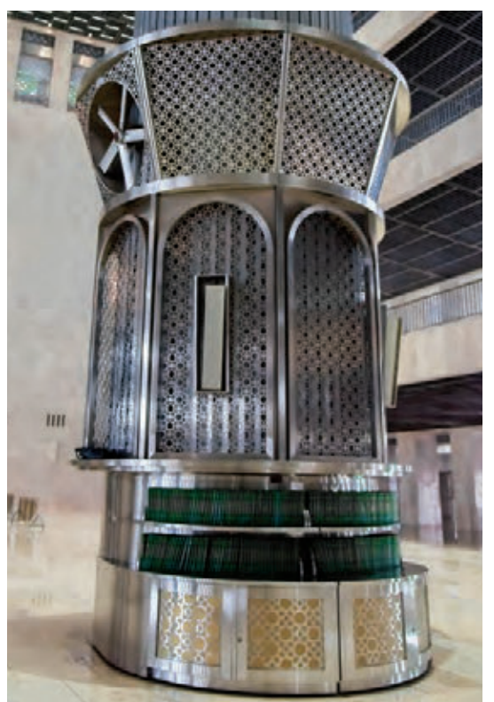
TOA SR-S4S columns are discreetly fixed to the vertical metallic framework pillars

six BPMI technicians have supervised the audio requirements in shifts since 1978.